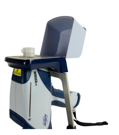
S1TITAN Handheld XRF analyzer Mg (12) to U (92)