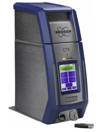
CTX<sup>™</sup> Portable XRF analyzer Mg (12) to U (92)