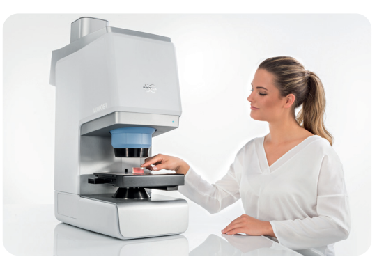
Analysis of a polymer sample with the FT-IR microscope LUMOS II.