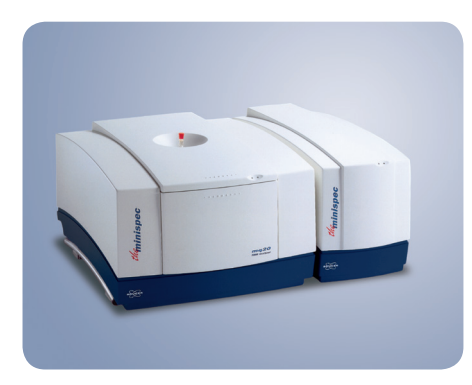
Bruker is the only vendor offering 40 and 60 MHz systems for contrast agent research.

A contrast agent will always accelerate the relaxation resulting in a positive or a negative contrast enhancement. Contrast agents like gadolinium, manganese chelates and iron salts lead to a T_1 signal enhancement. Superparamagnetic iron particles (SPIO), barium sulphate, air and clay have been used to lower the T_2 signal. Clinical MRI systems are certainly capable of the measurements, but MRI time is expensive and valuable for clinical investigations. The compact minispec is the perfect solution for such relaxation studies, because it offers systems providing the same magnetic field strength (e. g. 0.5 T, 1.0 T and 1.5 T) like clinical MRI systems.