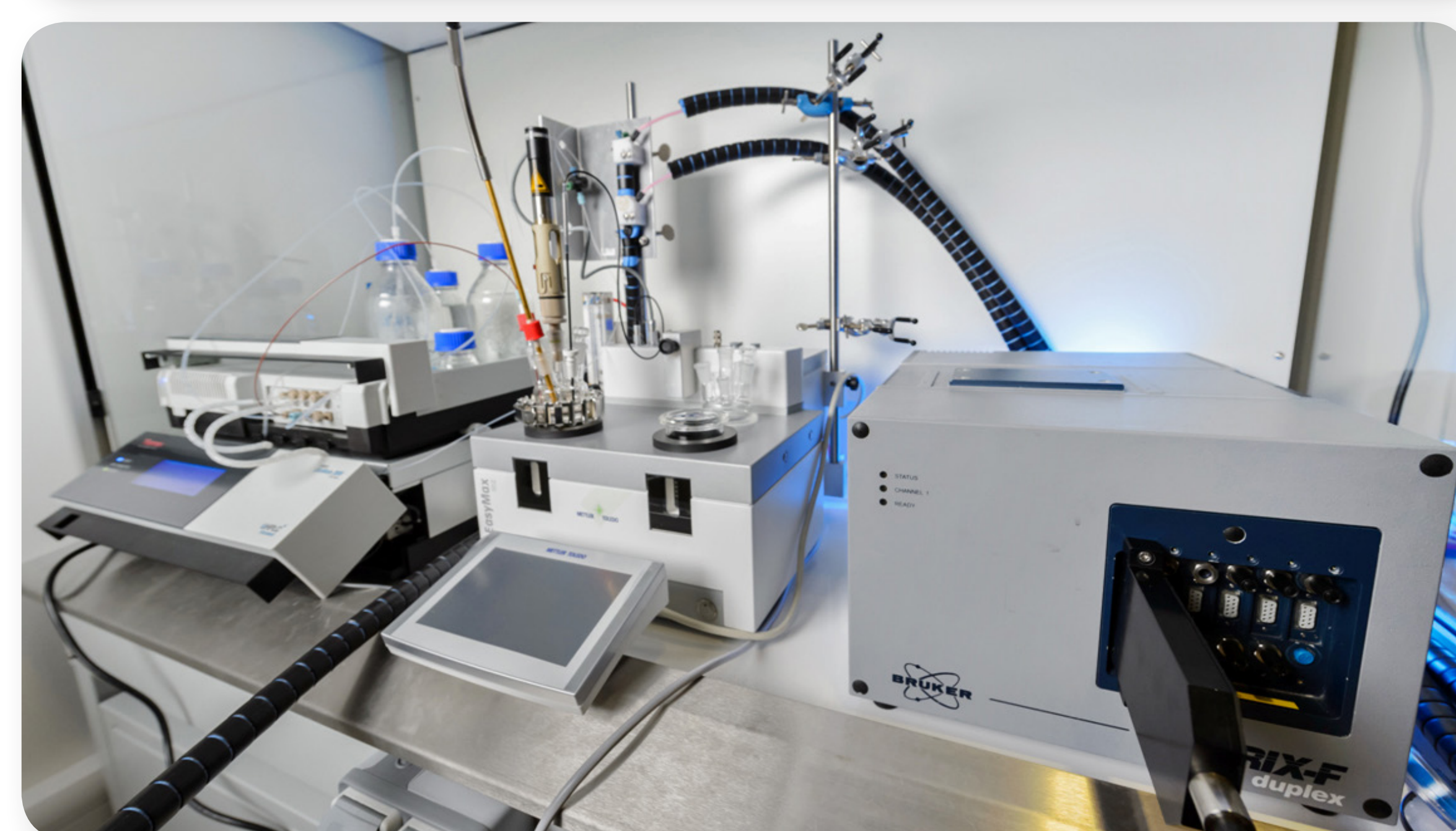
Fig. 2 Laboratory setup. Top: InsightMR flow unit, spectrometer, pump, vessel and bath. Bottom: Simultaneous online NMR and in-situ IR monitoring.