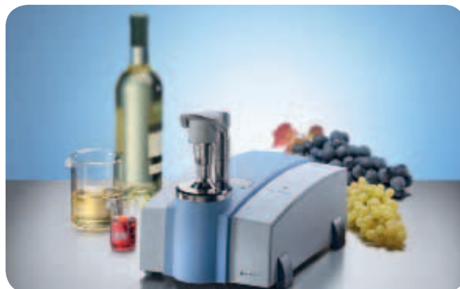
Figure 1: ALPHA-P wine-analyzer with flow through cell

The wine-sample is analyzed by utilizing the so called ATR measurement technique. The robust ATR diamond crystal allows measurements without sample preparation and guarantees precise and reproducible analysis results.