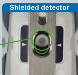
Undamaged detector when fitted with TITAN Detector Shield