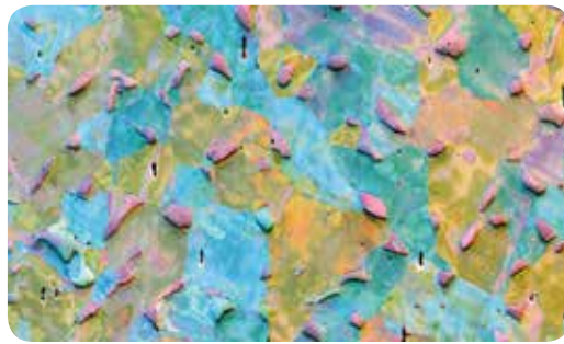
Color coded image produced by mixing the signals of the Bruker FSE detectors, showing microstructural details invisible in the grayscale image.