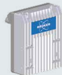
Fully integrated XFlash® detector

Sum spectrum (gray) of maps above and deconvoluted element peaks for silicon (blue) and tungsten (yellow)