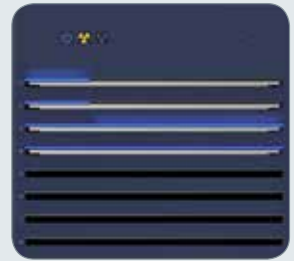
Measurement status LED