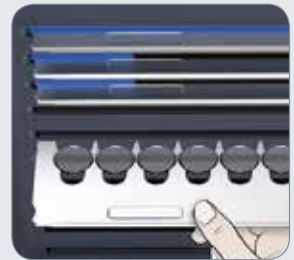
Tray with sample carriers