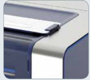
S4 T-STAR® with storage box